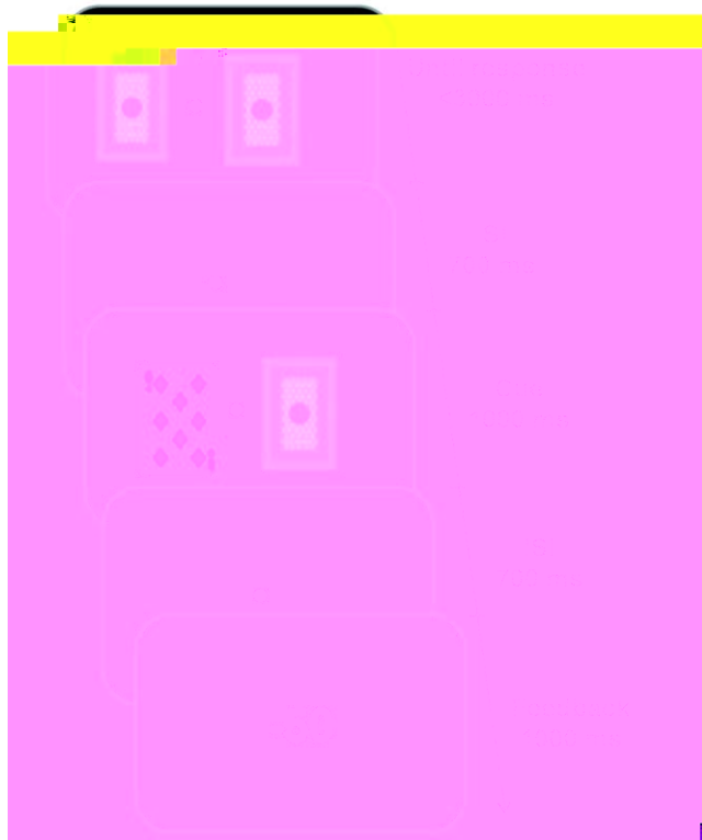
Fig. 1. Experimental design. doi:10.1371/journal.pone.0029633.g001

EEGs were recorded from 64 scalp sites using tin electrodes mounted in an elastic cap according to the International 10/20 system (NeuroScan Inc. Herndon, Virginia, USA). The impedance of electrodes was maintained below 5 K \Omega . Eye blinks were recorded from the left supraorbital and infraorbital electrodes. The horizontal electro-oculogram (EOG) was recorded from electrodes placed 1.5 cm lateral to the left and right external canthi. All